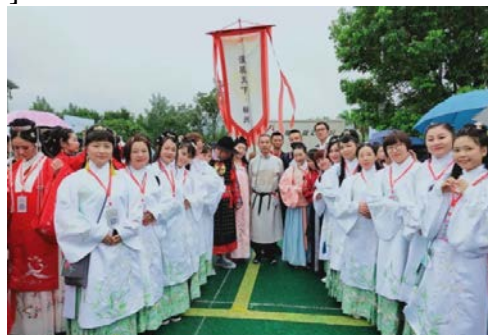
Figure 3 Culture Festival

Activity is an important way for students to acquire cognition and practice cognition. Colleges and universities should actively carry out cultural edification activities and strengthen the effect of culture and education, mainly including the following aspects: first, cultural propaganda activities. Colleges and universities should use the campus network, electronic display, campus broadcast and other cultural propaganda channels to push the excellent Chinese traditional culture in the form of small stories and news to create a cultural propaganda atmosphere. Second, cultural practice activities. Colleges and universities should use various community activities to practice cultural self-confidence cultivation work, such as Hanfu activities (Fig .3), Chinese Culture Festival and so on, so that students can have a deeper understanding of cultural cognition in the process of participating in the activities.[6].