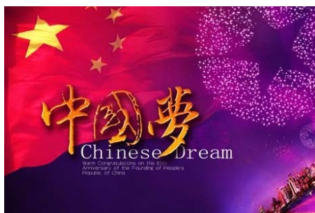
Figure 2 Chinese Dream

Traditional culture is not rootless water, its emergence and development all come from the life of the Chinese nation, contain in one story. Therefore, to cultivate college students' cultural self-confidence, we need to "tell" traditional cultural stories, help students through superficial things, truly internalize cultural knowledge, and practice life value goals to create a new generation of development stories. If contemporary college students lack cultural self-confidence, they can not produce national pride, and it is difficult to "tell well" the contemporary "development story".